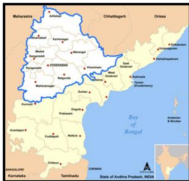
New State of Telangana is shown with blue border, the un-bordered white area is the current State of Andhra Pradesh. Formerly all of the white area was the State of Andhra Pradesh.